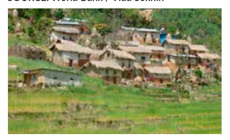
Dalit community, Wayal, Nepal