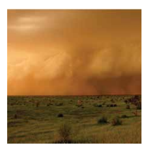
African Duststorm