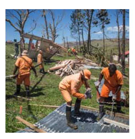
Fiji's recovery from Cyclone Winston

management, and is responsible for providing high quality advice to the Prime Minister, ministers and senior officials on the UK's readiness to prevent, respond and recover from major emergencies. This includes working in partnership with others in the Cabinet Office, other government departments, intelligence and other agencies, devolved administrations, the emergency services, charities, international bodies and organisation and emergency responders.