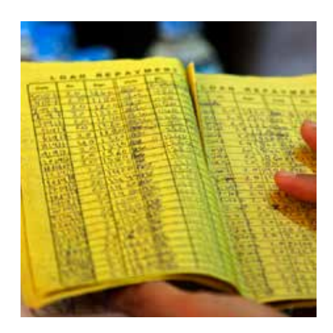
Financing for resilience, Mumbai India.