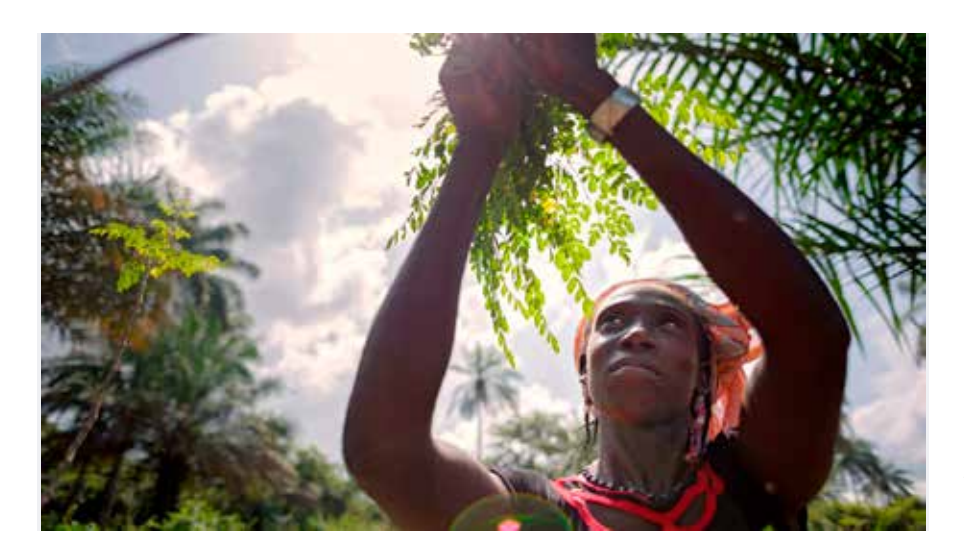
Tristao islands Guinea