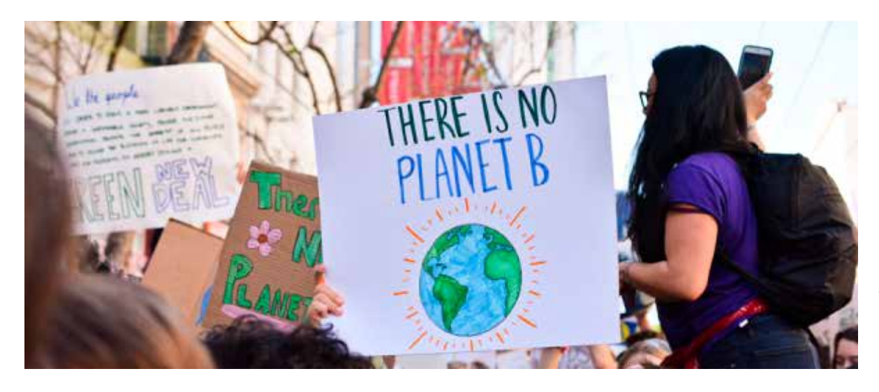
Youth call out UN, world leaders on climate action.