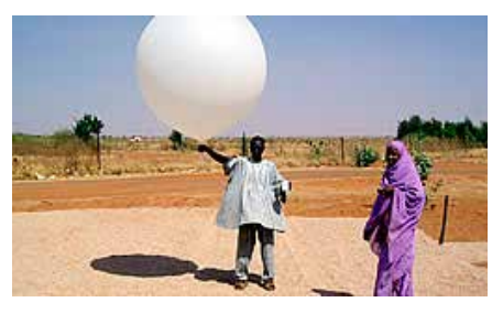
Weather Balloon, Africa