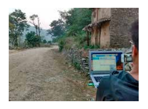
Investigating the factors affecting vulnerability and resilience to natural hazards